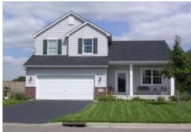
6541 Hartley Blvd N Classy 3 bd, 3 ba, modified two-story. SOLD for $278,000

Whether buying, selling, or just curious, please don't hesitate to call.