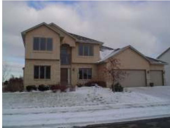
6851 Sussex Lane Exceptional 4 bd, 4 ba, 2-story walkout. Loaded with exquisite upgrades!