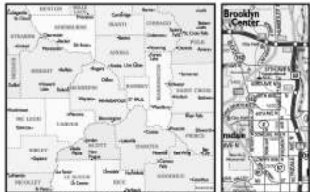
AREA OF MAP COVERAGE