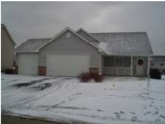
7034 Cambridge Road Pristine 3 bd, 3 ba multi-level with 3 car garage. SOLD for $292,000