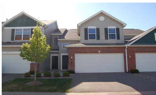
8002 Stratford Circle S Open and spacious one level 3 bd, 2 ba townhome $188,967