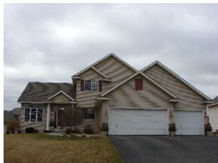
1609 Windsor Drive Beautiful 4 bd, 3ba Modified 2 story. SOLD