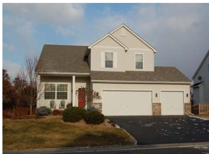
6677 Falmouth Curve Meticulously maintained! 4 bd, 4 ba, 2 story SOLD