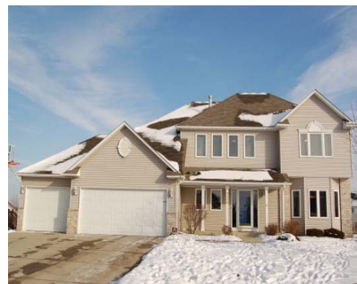
7324 Berkshire Circle Sprawling 5 bd, 4 ba 2 story SOLD