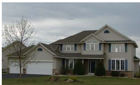
1492 Hartley Blvd S 5 bd, 4 ba 2 story with over 4,000 FSF $449,900